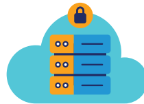
...communicates with the local grid via the internet, via secure servers...