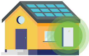
Your solar system's smart inverter

Solar customers with single phase power who choose Flexible Exports can export up to 10kW of excess solar energy (double the current fixed limit) almost all the time (95%)